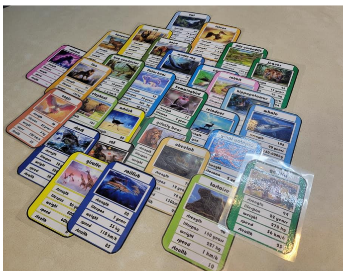
超級比一比 Top Trumps 一組 30 張卡片