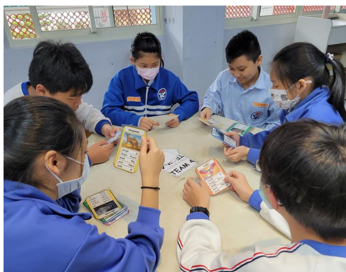
超級比一比 Top Trumps